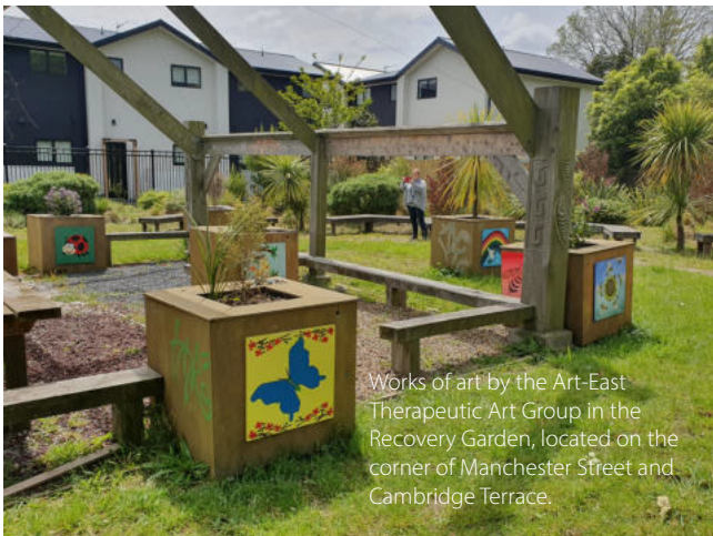
Works of art by the Art-East Therapeutic Art Group in the Recovery Garden, located on the corner of Manchester Street and Cambridge Terrace.